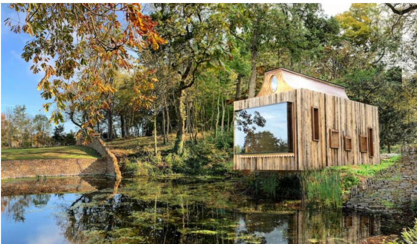
Waterside Bee House